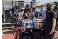
NewFilmmakers Los Angeles