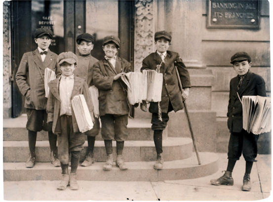
Jersey City Newsies

6 years old, worked. Many of these young people were from immigrant families recently arrived in America, a country that was at once full of opportunity and that also rapaciously took advantage of the poor, no matter what age. Children would